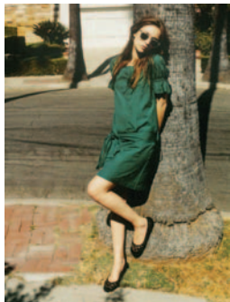
Valentine - APC